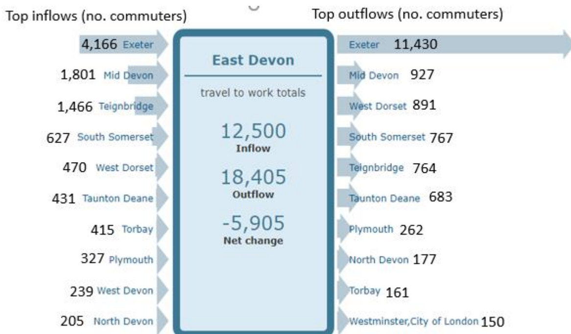
Figure 3.1: Top inflow and Top outflow of commuters in East Devon 26

3.5 The influence of Exeter in employing East Devon residents is reflected in data on Travel to Work Areas (TTWAs). 27 Indeed, Exeter’s strong economic draw has seen its TTWA grow to be the second largest in the country. As shown in pink on the map below (figure 3.2), the Exeter TTWA extends far into East Devon, with the Sidmouth TTWA covering the south eastern part of the district. Further detail on travel to work patterns for the larger settlements is discussed later in this chapter.