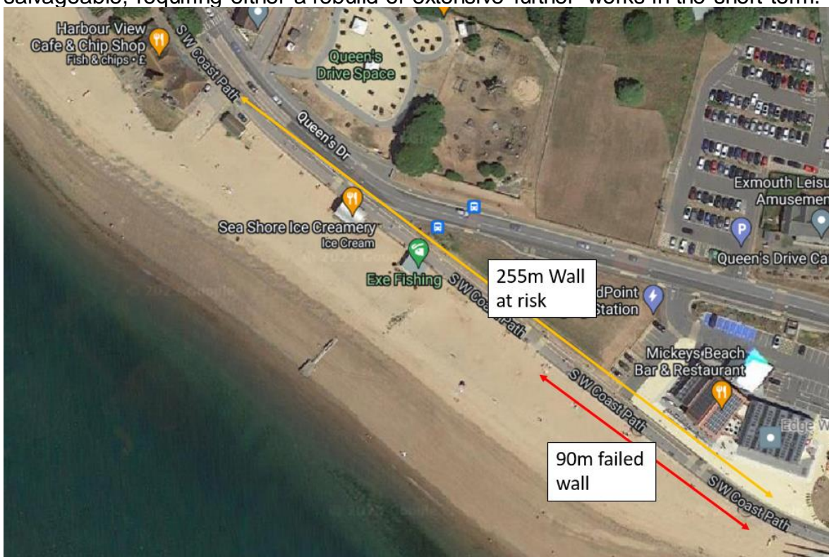
Image 4.1. Map of extents of the work.