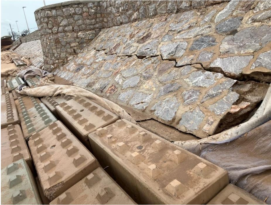
Image 1.5. Wall damage and temporary repairs.