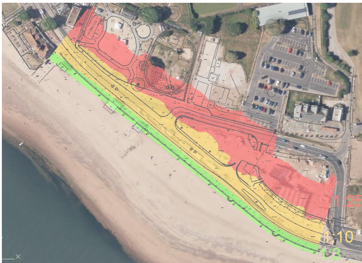
Image 6.1. Erosion map if seawall left to fail.

6.1. Our consultants have run some high-level calculations and believe there could be a maximum eligibility for external funding from the Environment Agency of sub £400k, however this could reduce by £150k due to complications around new development. It is worth noting this contribution is not guaranteed. This contribution figure is lower than other EDDC projects, due to lack of residential property behind the wall at risk of flooding/erosion.