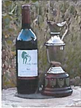
The Sunny Bank Trophy for the Best Red Wine at the South West Vineyards Association Competition 2013