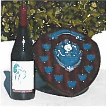
John Buchan Shield for the Best Red Wine From A Small Producer 2009